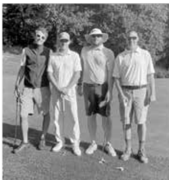
2022 golf tournament champions, Unifirst